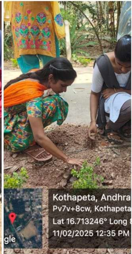
Kothapeta, Andhra Pradesh, India Pv7v+8cw, Kothapeta, Andhra Pradesh Lat 16.713246° Long 81.893614° 11/02/2025 12:35 PM