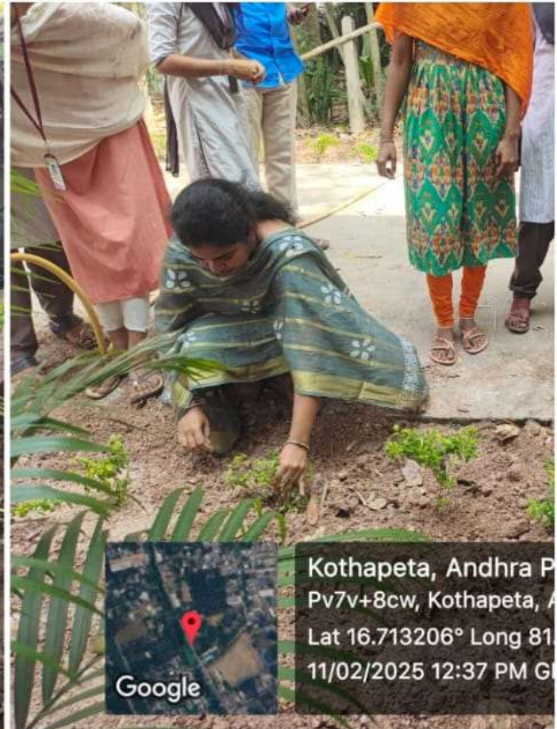
Kothapeta, Andhra Pradesh Pv7v+8cw, Kothapeta, Andhra Pradesh Lat 16.713206° Long 81.893575° 11/02/2025 12:37 PM GMT +05:30