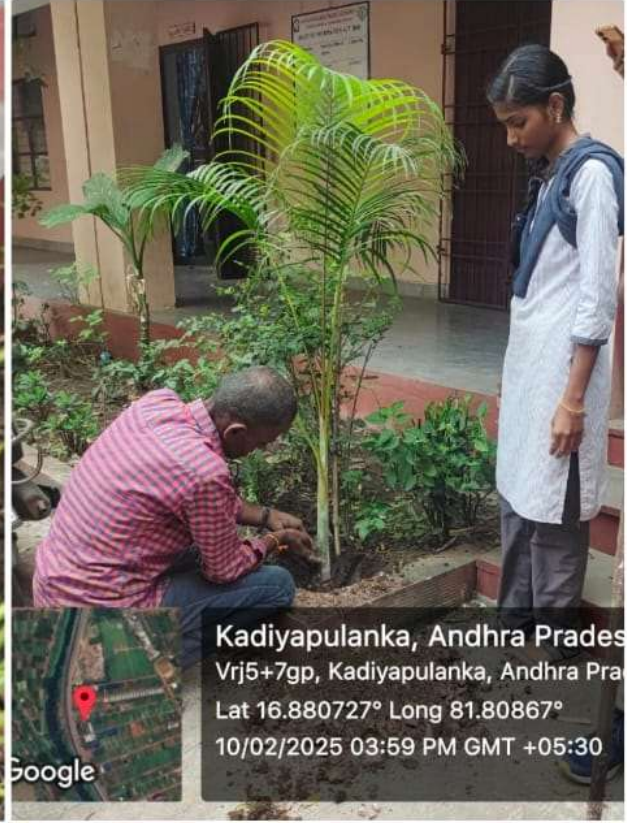
Kadiyapulanka, Andhra Pradesh Vrj5+7gp, Kadiyapulanka, Andhra Pradesh Lat 16.880727° Long 81.80867° 10/02/2025 03:59 PM GMT +05:30