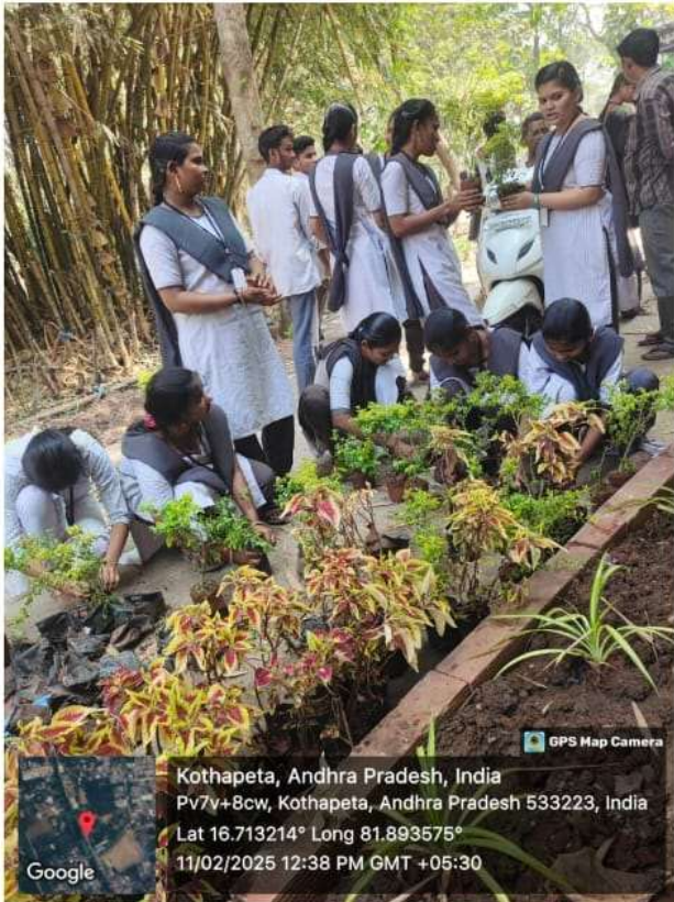
Kothapeta, Andhra Pradesh, India Pv7v+8cw, Kothapeta, Andhra Pradesh 533223, India Lat 16.713214° Long 81.893575° 11/02/2025 12:38 PM GMT +05:30