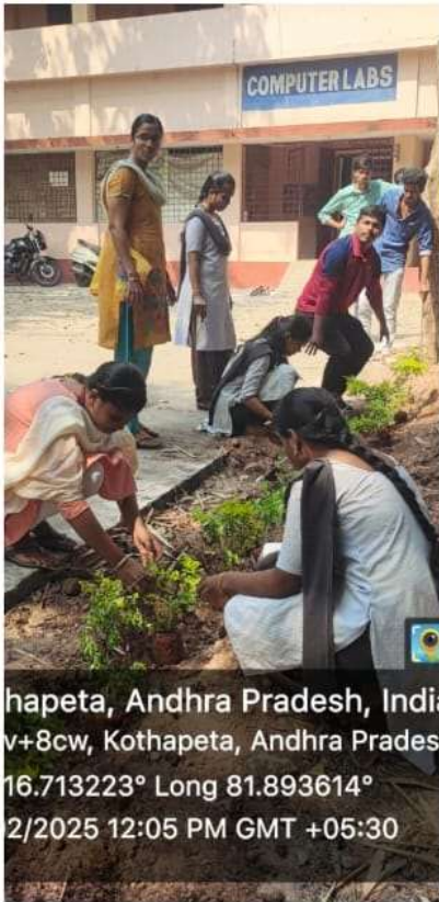
Kothapeta, Andhra Pradesh, India Pv7v+8cw, Kothapeta, Andhra Pradesh Lat 16.713223° Long 81.893614° 11/02/2025 12:05 PM GMT +05:30